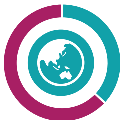
34 Australian and international investors

ACSI members can achieve financial outcomes for their beneficiaries through genuine and permanent improvements to the environment, social and governance (ESG) practices of the companies in which they invest.