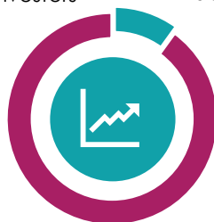
ACSI members manage $1 trillion in funds