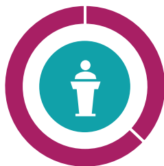
Leading voice on ESG issues